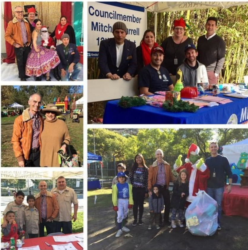
Juntos Park in Glassell Park